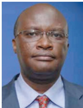
James Macharia Cabinet Secretary, Ministry of Health

In the last 30 years of the HIV epidemic, the world has devoted unprecedented human, technological and financial resources. Researchers have devoted substantial time and effort to identifying prevention options, advancing treatment and cure research and vaccines for HIV infection. Kenya, in particular has made significant contributions to the body of knowledge in all areas of HIV prevention, treatment and care. High quality and ethically sound research findings from Kenya have informed policy and practice in HIV testing and counselling, male circumcision, anti-retroviral options for treatment, prevention of perinatal transmission and more recently prevention on pre and post exposure to HIV. Kenya's outstanding record in HIV research leadership is evidenced by high numbers of peer-reviewed publications in high impact factor journals and high numbers of proposals processed through ERCs monthly. Kenya's contribution to Vaccine development remains highly regarded with trials in Kenya offering hope for a future free of HIV.